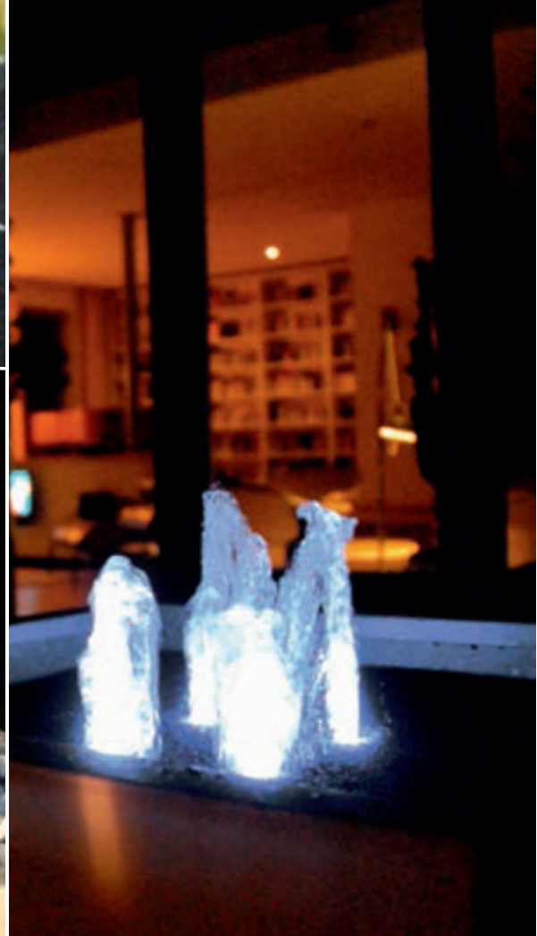
Application examples: 4 x LunaLed 9 s on a separate base construction, combined with the aid of the OASE multiple distributor