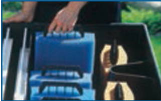
Filter foams For settlement of microorganisms for decomposition of pollutants and nutrients.