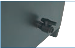
Ball valve Clean water outlet back to the pond lowers the water level in the filter and enables water saving filter cleaning.