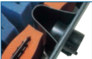
Discharge chamber with DIN 110 connection