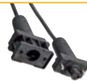
LunAqua Power LED cable 10 m