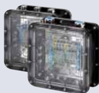
Junction Box 8/M20 and 14/M20