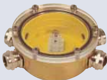
Underwater cable connector T 3

Cable connectors are connecting and separating elements for electrical consumers in all areas of water technology. Consumers can be conveniently connected and disconnected – and thanks to OASE – even without draining the water!