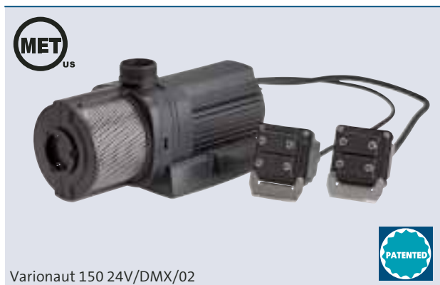
Varionaut 150 24V/DMX/02