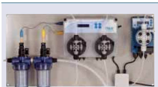
Clear Fountain System