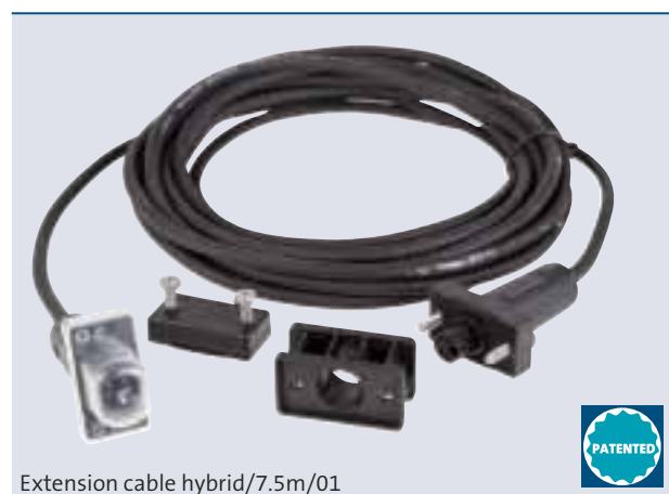
Extension cable hybrid/7.5m/01