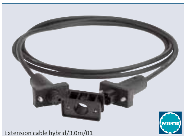
Extension cable hybrid/3.0m/01