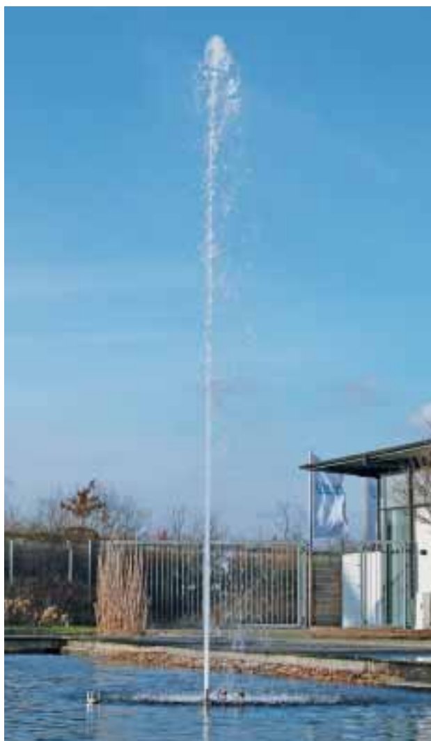
Cluster Eco 15-38