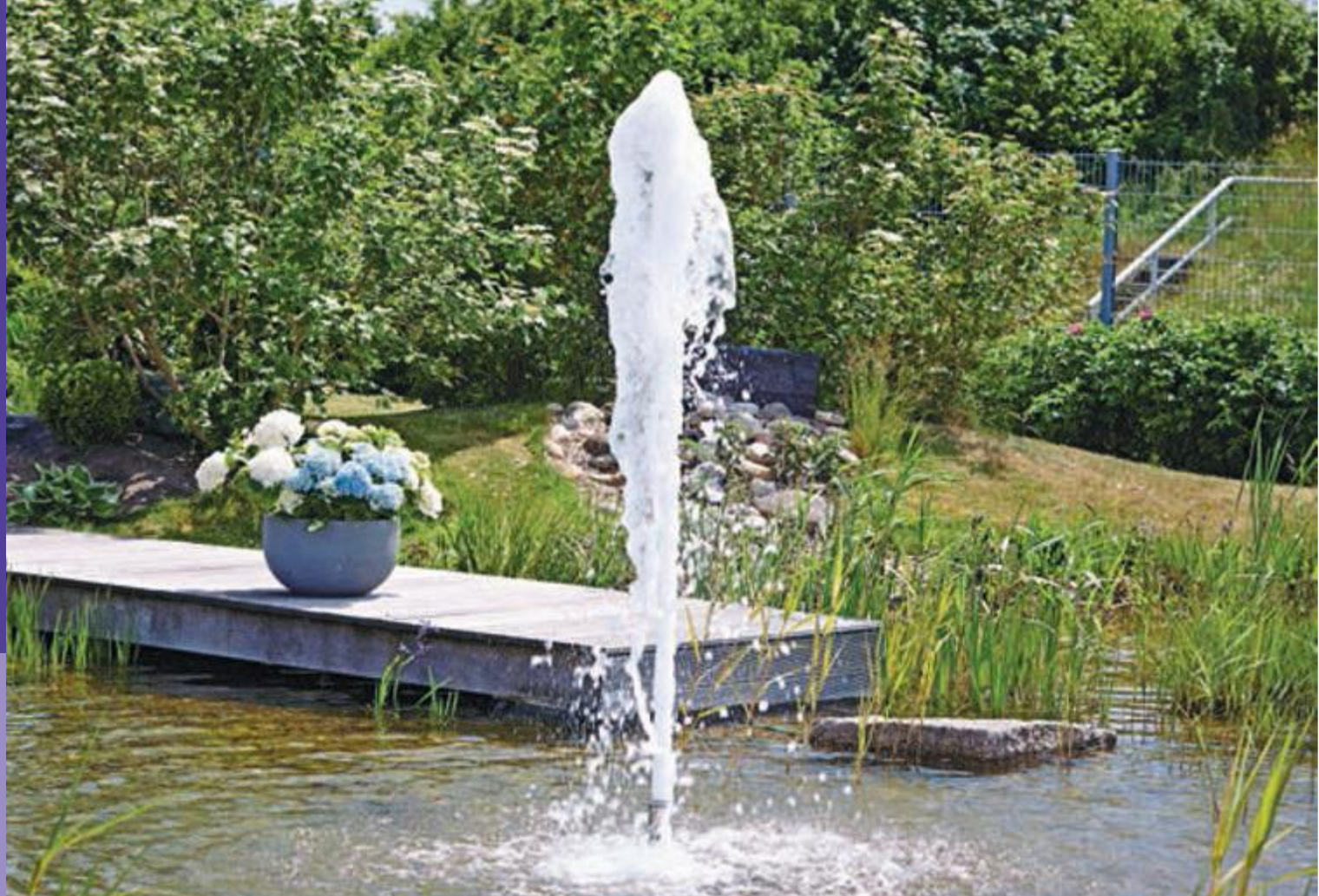
Application example: Aquarius Universal Expert with Schaumsprudler 55 - 15 E