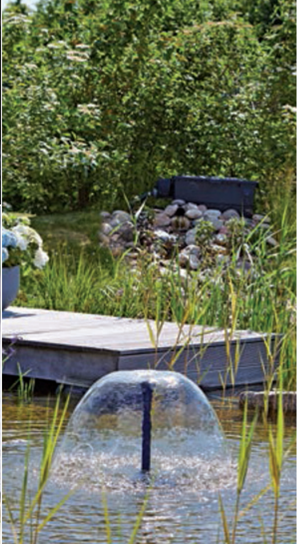
Aquarius Fountain Set Eco installed