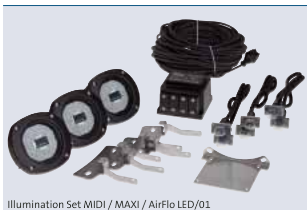
Illumination Set MIDI / MAXI / AirFlo LED/01

For an impressive floating fountain even at night – as easy as our proven AirFlo system, we offer you a LED version of our illumination kit with three spotlights each. A unique connection system makes it very easy to install the spotlights on the float. The UST 150 transformer is mounted easily to the pump basket directly.