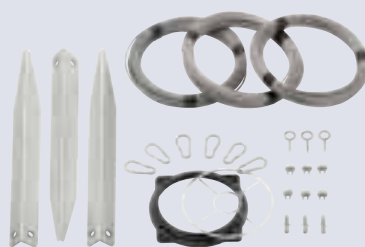
Fastening material Easy and secure anchoring of the aerator thanks to the fastening material included in the scope of delivery. (3 x 30 meter, 3 mm thick)