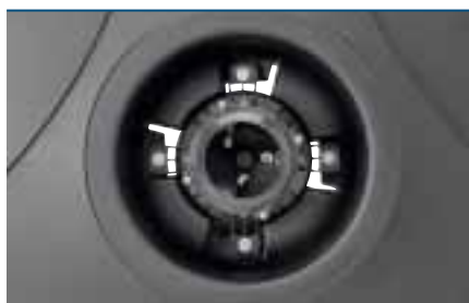
Bayonet technology for easy mounting.