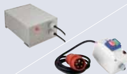
Earthing pin plug + control box The 230V version is delivered ready to operate with control box.