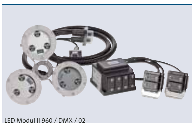
LED Modul II 960 / DMX / 02