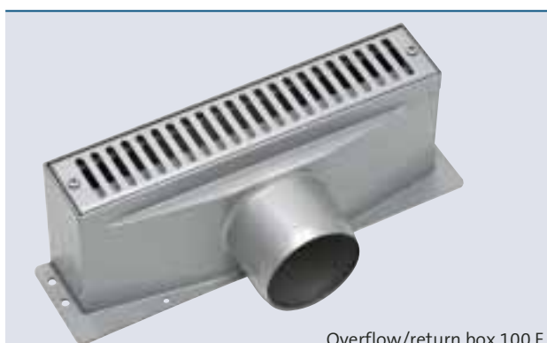
Overflow/return box 100 E