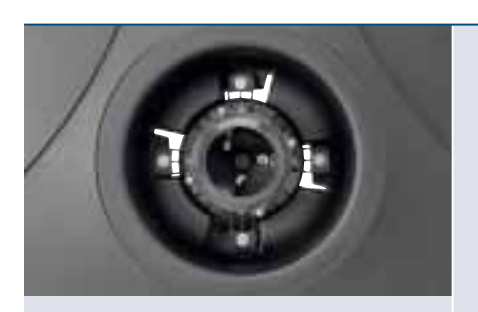
Bayonet technology for easy mounting.